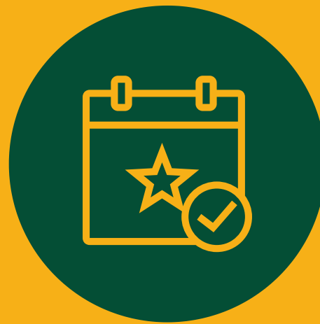
Student Events + Theme Nights