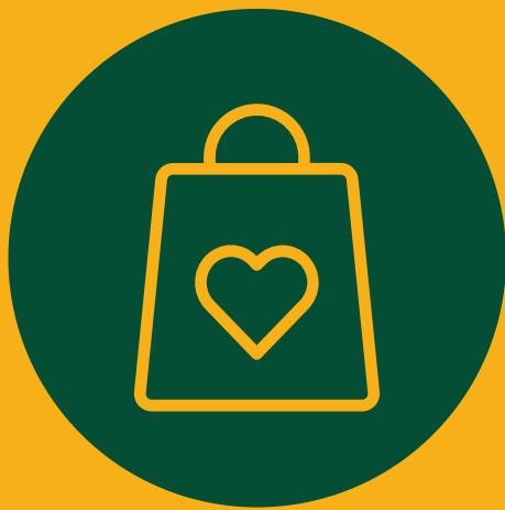
Giveaways + Contests for Students