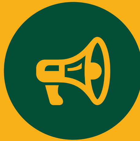
Student Targeted Ad Campaign