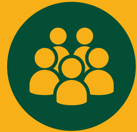
Increased partnerships w/ Campus Groups