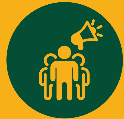
Hiring Student Ambassadors